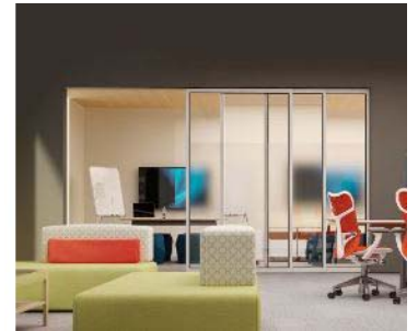
Drywall or Bulkhead